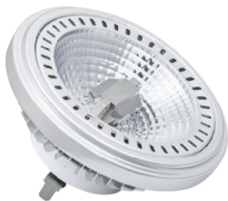
AR-111 LED REF G53