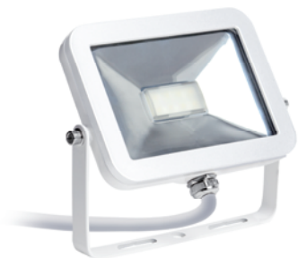
TINI LED 11W