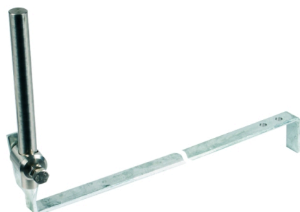
Figure without obligation