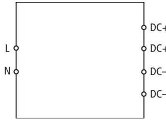
Basic circuit diagram PSU DC24 30W