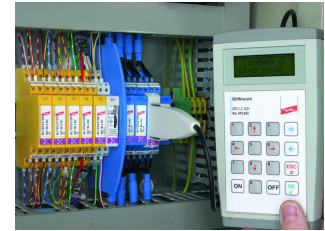
Snap-on LifeCheck sensor

Portable device with RFID LifeCheck sensor for flexible use. For the quick inspection of arresters with RFID LifeCheck. Equipped with visual and acoustic indication. Also equipped with USB port and PC database software for the PC-supported management of specimens and the documentation of test results. The DRC LC M3+ is equipped with a snap-on RFID LifeCheck sensor. The hand-held equipment also supports the parameterisation of the arresters for condition monitoring.