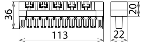
Dimension drawing BM 10 DRL

Plug-in SPD block (without SPDs) for 1 to max. 10 three-pole GDT 230 B3 ... gas discharge tubes. Also suitable for DRL protective plugs with earthing frame.