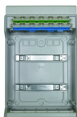
Integrated plug-in terminal technology for PE and N conductors.