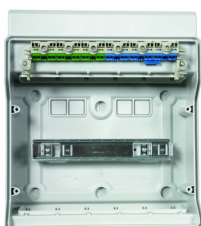
Integrated PE and N plug-in terminals.