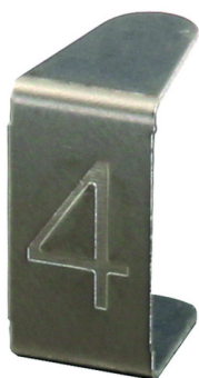
Figure without obligation