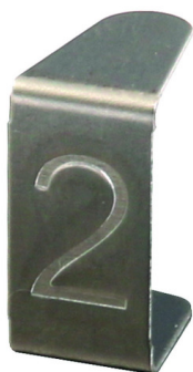
Figure without obligation