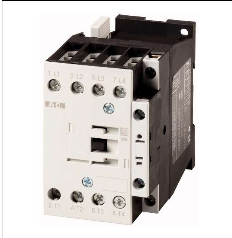
Contactor (DIL Frame 2 DC 4-pol)