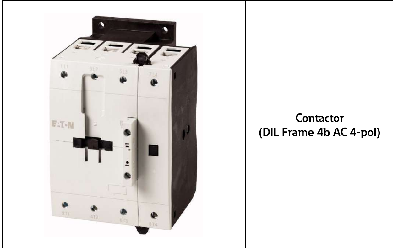
Contactor (DIL Frame 4b AC 4-pol)