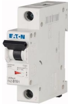
Miniature Circuit Breaker (FAZ Series)