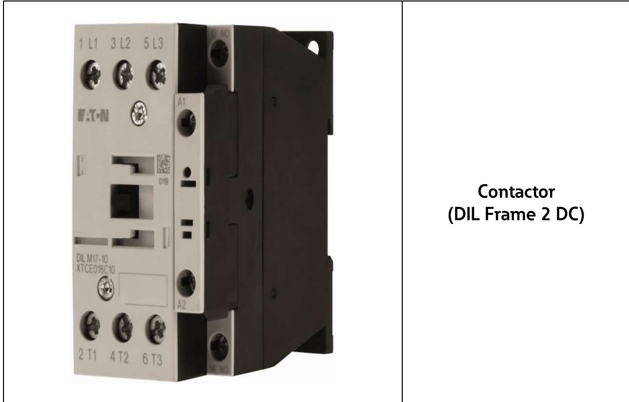
Contactor (DIL Frame 2 DC)