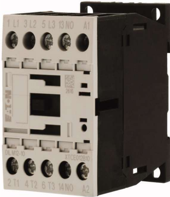
Contactor (DIL Frame 1 DC)