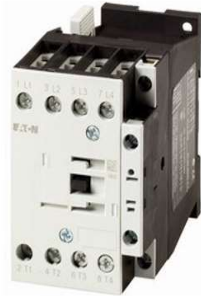
Contacteur (DIL Frame 2 AC 4-pol)