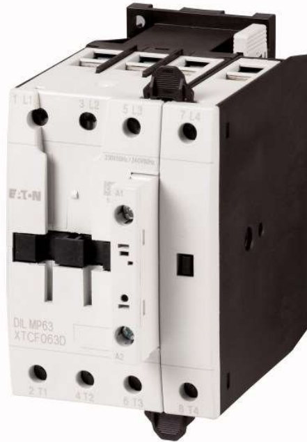
Contactor (DIL Frame 3 AC 4-pol)