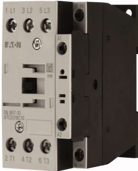
Contacteur (DIL Frame 2 AC)