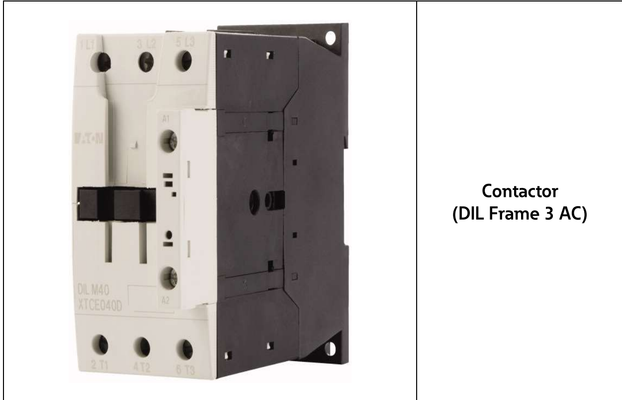
Contacteur (DIL Frame 3 AC)