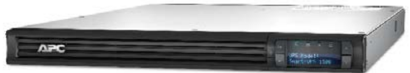
[ SMT1500RM11U ]