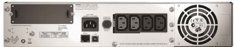
[ SMT1500RM12U ]